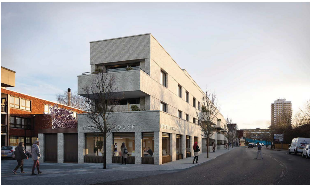
View from the north