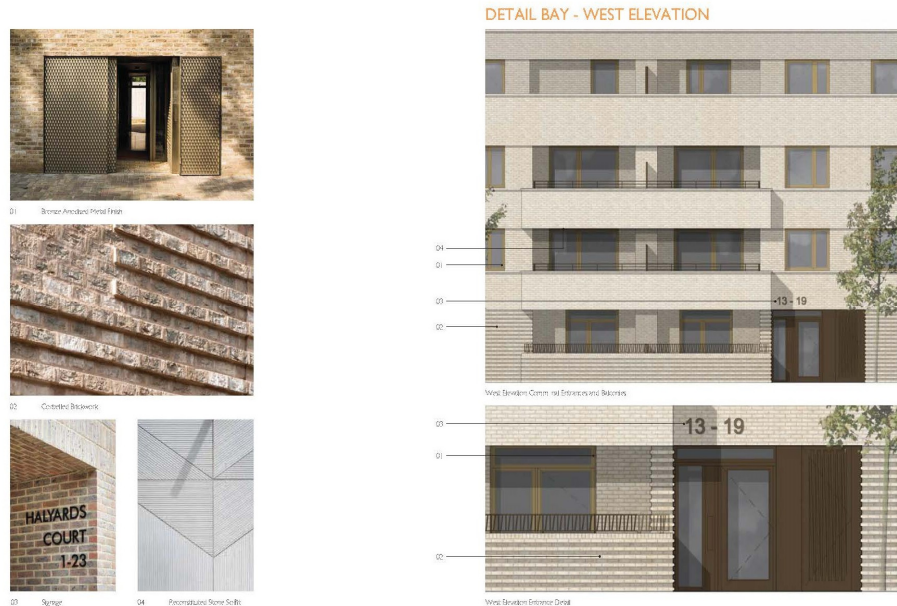
Architectural detailing and indicative materials