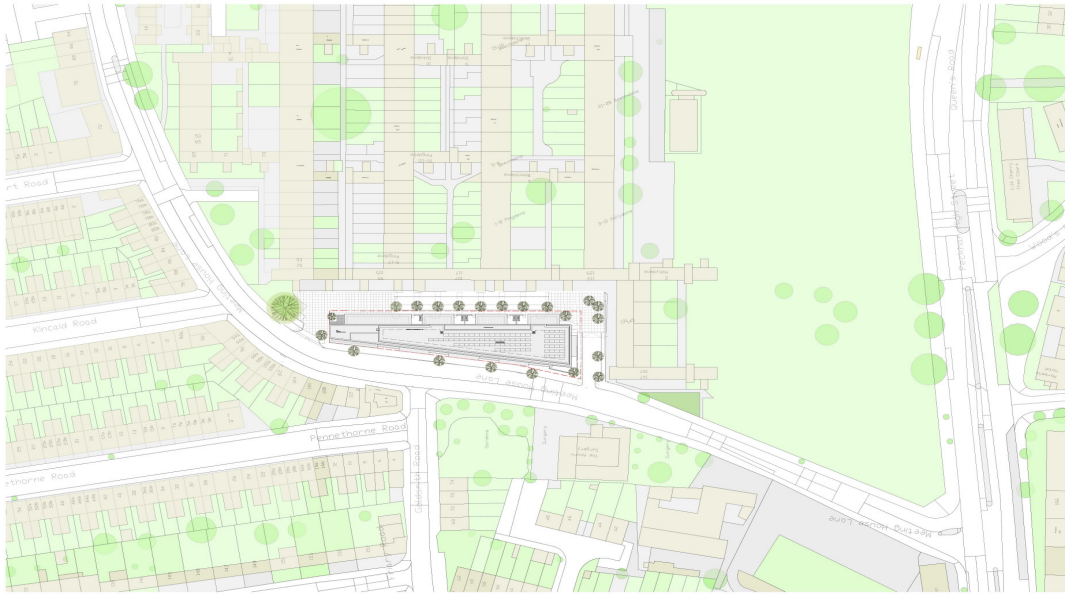
Site location plan